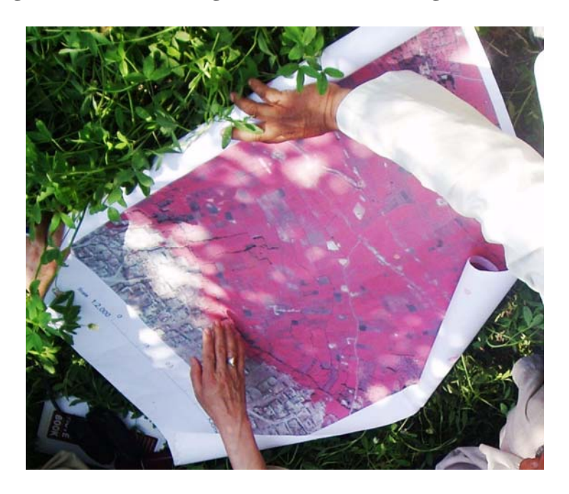
Figure 2: Satellite Image Used to Delineate Ag Land Parcels

Using the ADAMAP methodology the village team which prepares the parcel specification forms, simultaneously delineates the boundaries of parcels to which the forms refer, and gives them unique identification numbers. Figure 6 shows a satellite image, plotted at a scale of 1:2,000 being used for delineating irrigated agricultural land parcels in the village of Naw Abad. Each form produced by the field team in consultations with the owners or their representatives, is reviewed by a group of village elders who sign each form when in agreement with its contents.