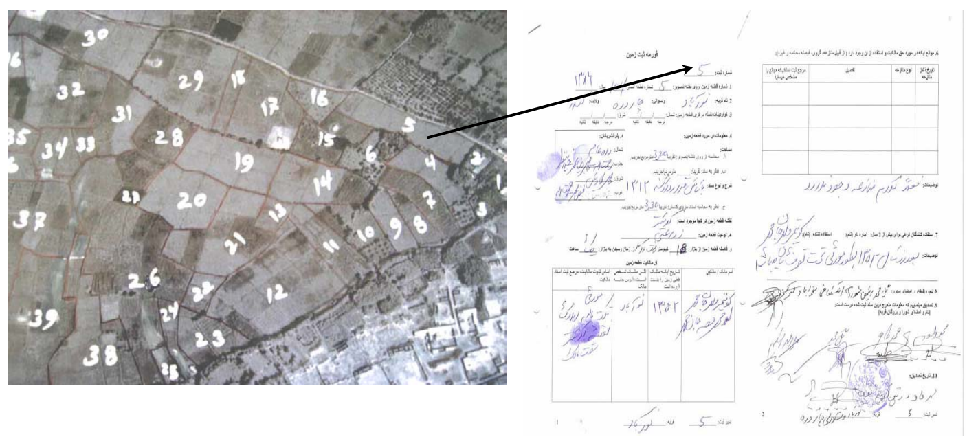
Figure 3: The village-based parcel register for private agricultural land

However, due to the limited testing of methodologies for cropland during the pilots, any extension of the approach will require additional piloting to develop further amended methodologies suitable for ownership of croplands. This includes the role of 'Village Recording Secretaries' designated by the community council, who shall be responsible for the management and archiving of delineated satellite images and parcel forms and who need training in the procedures for maintaining and updating cropland ownership records and maps. Also, questions pertaining to the amount of review needed of the field teams' work on boundary delineation and parcel register forms and how to control unauthorized changing of parcel records need to be addressed further. Finally, ownership and boundaries of state-owned cropland parcels needs to be done unanimously to assure proper recording.