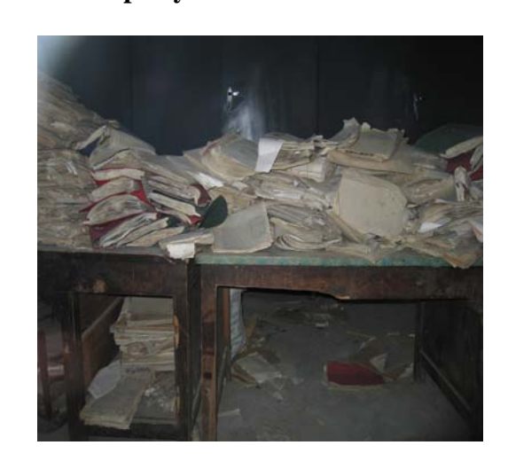
Figure 1: Property Documents in a Court Archive

Other institutions must certify as to the identity of the owners of transacted properties—the Amlak for rural properties and Municipalities for urban ones--and the payment of different transfer fees, but Judges or their Clerks actually write the deeds. Copies of all deeds are kept in the Provincial Court Archives<sup>31</sup>. As for many governmental institutions, however, the judiciary and other agencies which administer property ownership information are weak, beginning with extreme disorder in the archiving of property documents (see Figure 1).